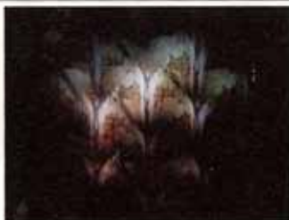
Installation shot of 'Are You Lonesome Tonight' by Conrad Ventur

Tom Badley's stuttering, grinding video, viewable through cracked glass over an LCD screen, seems at first like an ominous semi-abstract before it suddenly surges forward and reveals itself to be a cheery film of a woman